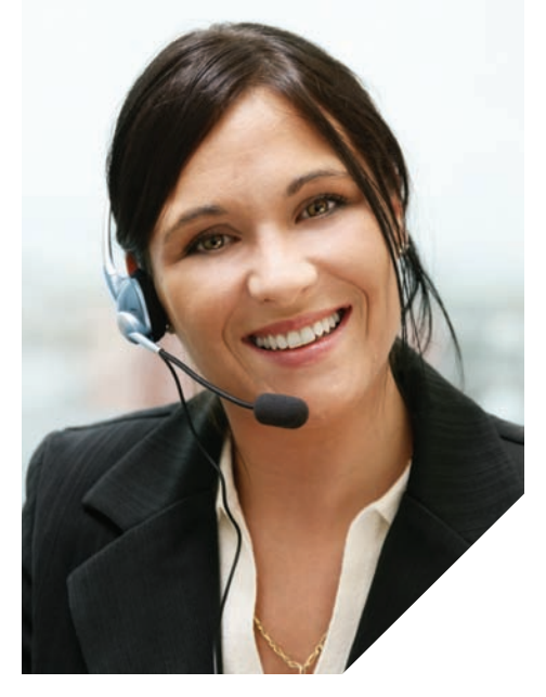
Customer service representatives standing by to serve you.

Welding of Ceramaseal<sup>®</sup> products using an automatic T.I.G. welding lathe